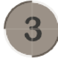
Run The Test