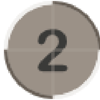
Use Diagnosis Code 77686378